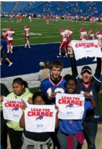
Youth enjoying a game courtesy of a donation from Buffalo Bill Marcell Dareus. The Sky Is The Limit program provides socialization, educational, recreation and respite activities for youth with developmental disabilities and their families.

Our trusted neighborhood centers and staff are responding to the increasing needs of families and seniors for food, clothing and shelter. Many of our programs assist people with resources to meet these basic needs and support older adults and individuals with developmental disabilities to maximize independence and quality of life: