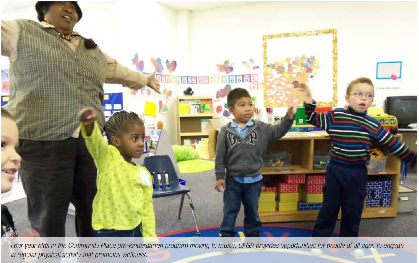
Four year olds in the Community Place pre-kindergarten program moving to music; CPGR provides opportunities for people of all ages to engage in regular physical activity that promotes wellness.