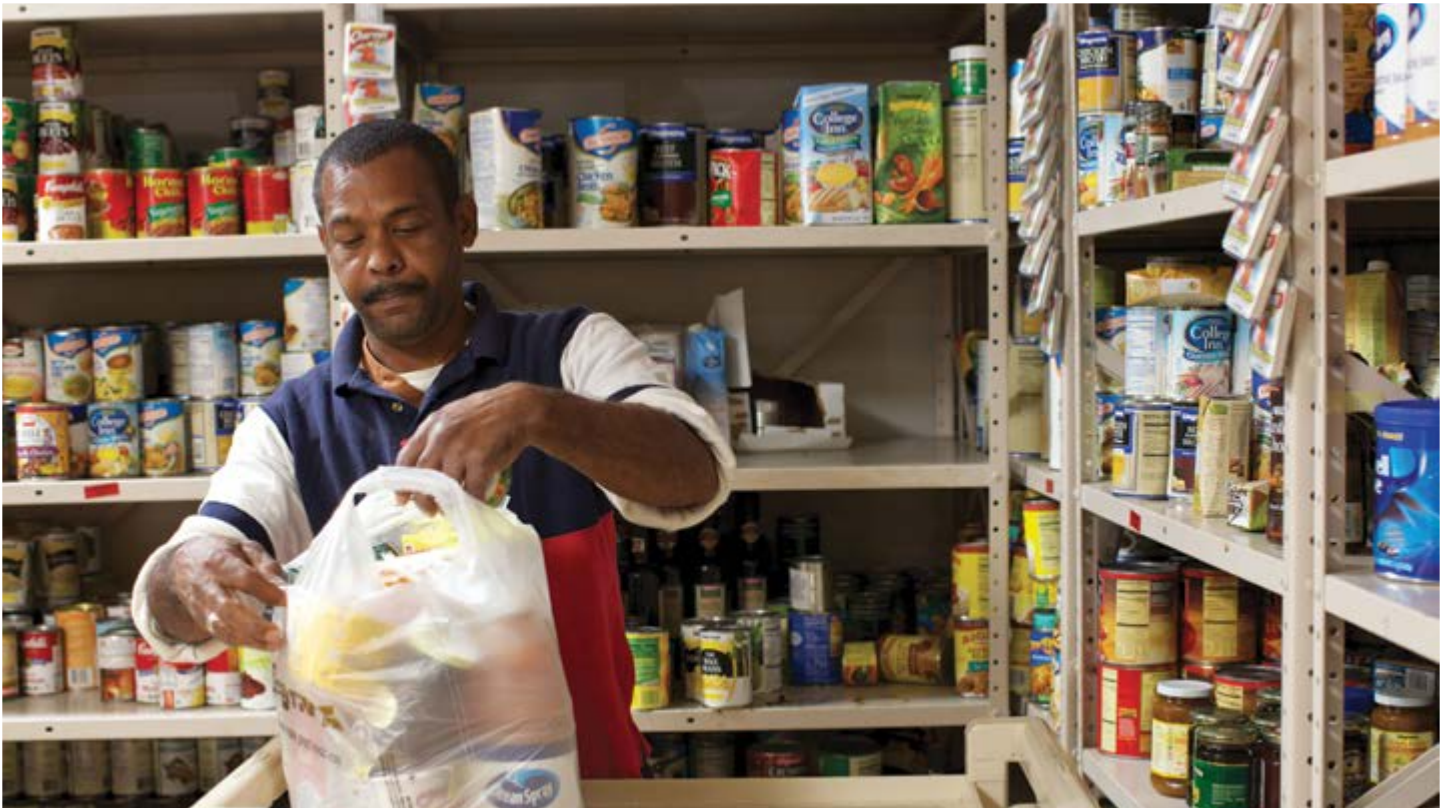
A Community Place staff person working in the Food Pantry, an ever-increasingly important resource for our neighbors to have access to nutritious foods, including fresh produce, which is a fundamental component of healthy living and preventing hunger.