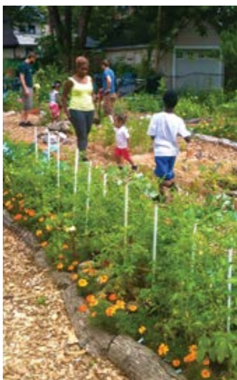
Families creating community garden as part of Strengthening Eating + Exercising Daily Successfully (SEEDS) program.

There is growing concern about the high rates of chronic disease and the lack of nutritious food and exercise among Rochester residents, particularly those with lower incomes and less resources. Thousands of individuals of all ages participate in programs annually at our sites, providing an opportunity to introduce programs that promote wellness in a comfortable, supportive environment.