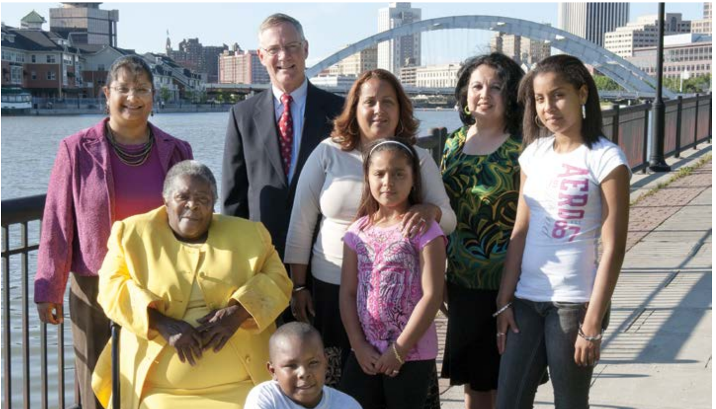
The Community Place brings together people of all ages from all walks of life united in one common goal—to improve the quality of life of all Monroe County residents—by providing programs and services that teach, encourage and maintain self responsibility and civic pride.